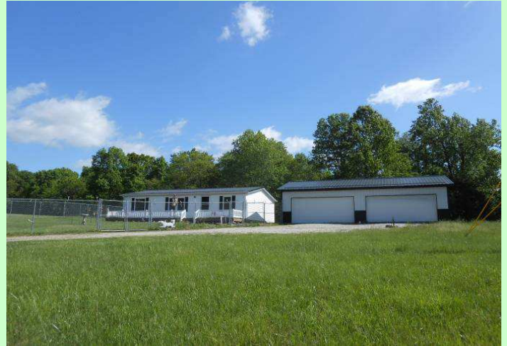
FRONT VIEW AS YOU APPROACH THE RESIDENCE & HUGE DETACHED GARAGE