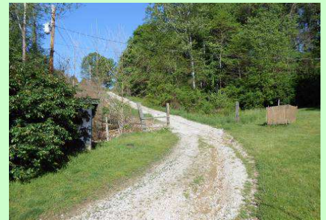
WHAT A PLEASANT & PICTURESQUE DRIVEWAY LEADING INTO THE PROPERTY!