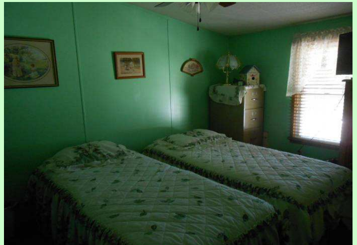
THE TWO GUEST BEDROOMS