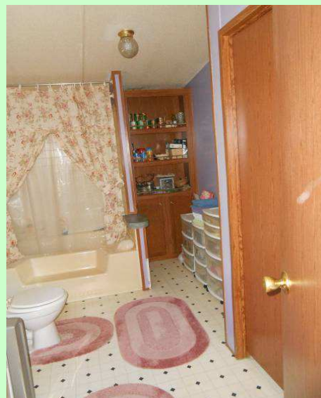
TWO VIEWS OF THE MASTER BATHROOM