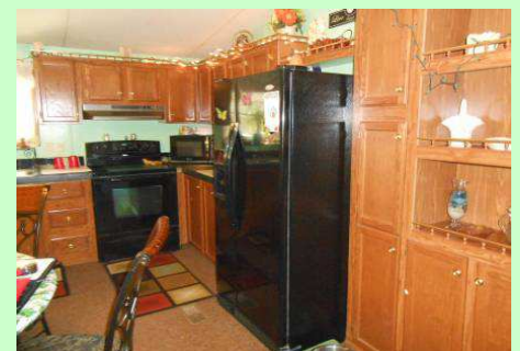
VERY NEAT & EFFICIENT "EAT-IN" KITCHEN AREA