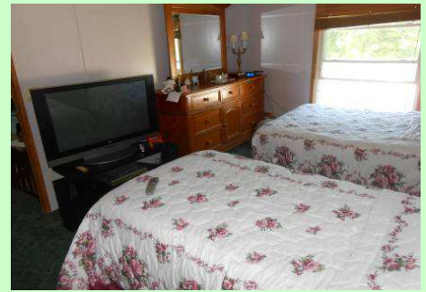
SPACIOUS LIVING ROOM...AND THE MASTER BEDROOM WITH ADJACENT MASTER BATH