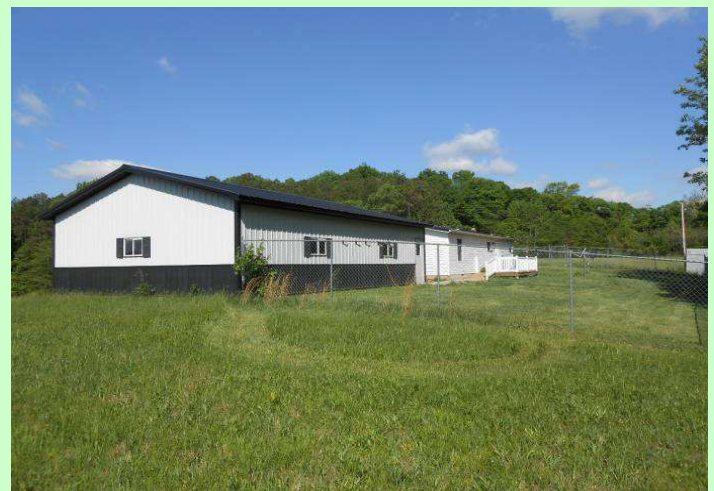
REAR VIEW OF THE RESIDENCE & HUGE DETACHED GARAGE