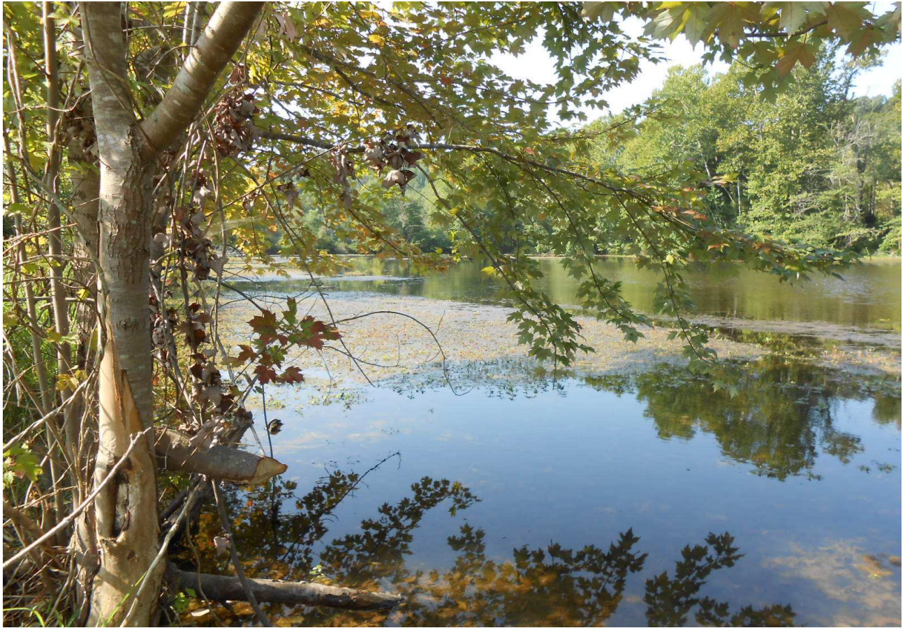
These two photos were taken in August 2018. What a Great Little Lake!!!